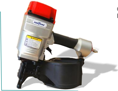
CLAVILLADORA RONG PENG