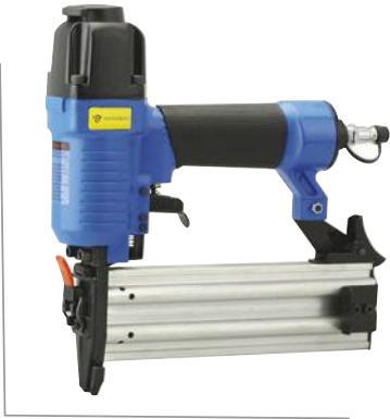
CLAVILLADORA RONG PENG